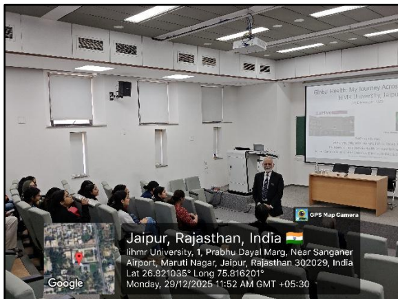
Jaipur, Rajasthan, India Iihmr University, 1, Prabhu Dayal Marg, Near Sanganeer Airport, Maruti Nagar, Jaipur, Rajasthan 302029, India Lat 26.821036° Long 75.816201° Monday, 29/12/2025 11:52 AM GMT +05:30