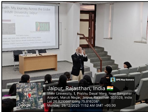
Jaipur, Rajasthan, India Iihmr University, 1, Prabhu Dayal Marg, Near Sanganeer Airport, Maruti Nagar, Jaipur, Rajasthan 302029, India Lat 26.821006° Long 75.816206° Monday, 29/12/2025 11:52 AM GMT +05:30