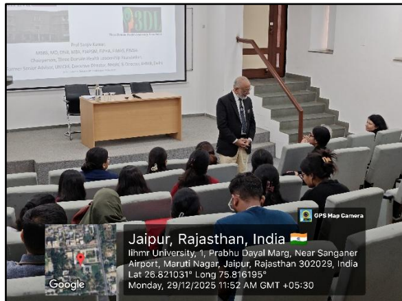
Jaipur, Rajasthan, India Iihmr University, 1, Prabhu Dayal Marg, Near Sanganeer Airport, Maruti Nagar, Jaipur, Rajasthan 302029, India Lat 26.821031° Long 75.816195° Monday, 29/12/2025 11:52 AM GMT +05:30