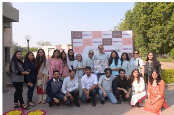
IIHMR Alumni Relations Committee along with the beloved Alumni from the PGDHM First Batch