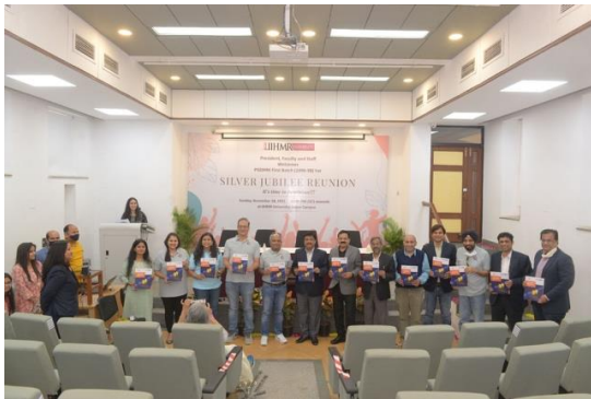
Placement Brochure 2020-2022 unveiling ceremony

After the thought provoking and inspiring speech, it was now time for a very special event. Placement season for the second-year students has arrived and who better than our special alumni to unveil the brochure and open the gateway of opportunities for the present batch. The gift-wrapped brochures were distributed among the alumni and together with the faculty, the placement brochure unveiling ceremony unfolded.