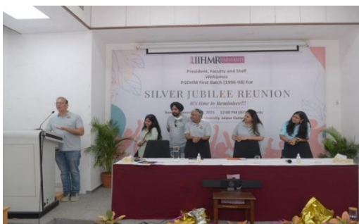
Alumni from the PGDHM First Batch (1996-1998) addressing the gathering