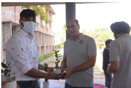
Welcoming the Alumni from the PGDHM First batch to their Alma Mater after 25 years