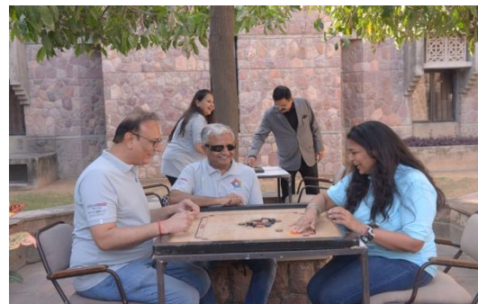
Reliving the memories on campus with some fun games and activities

After visiting the hostel, the guests were proceeded towards the MDP Centre where an elaborate lunch was organised. The guests, professors and Alumni team enjoyed the delicacies together.