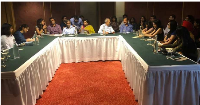
May 20th, 2019 : Coffee with IIHMR @ Delhi