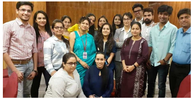
May 21st, 2019 : Coffee with IIHMR @ Gurgaon