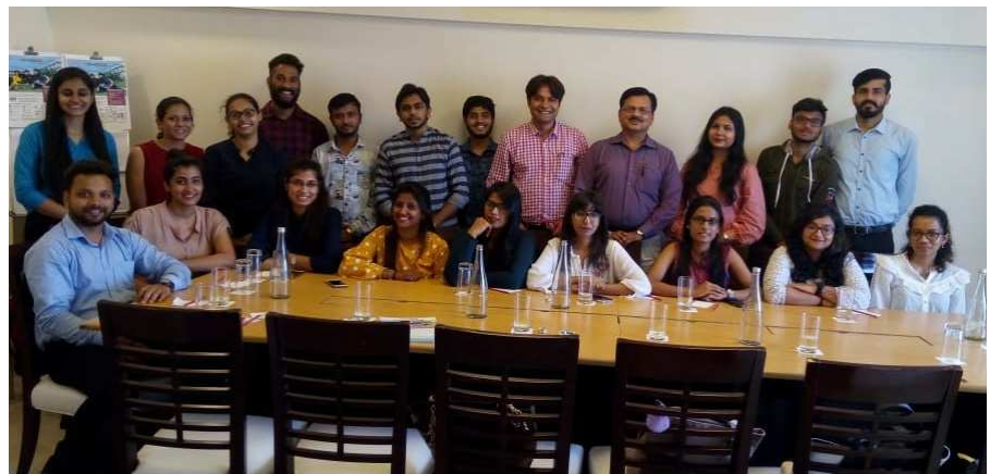
May 21st, 2019 : Coffee with IIHMR @ Mumbai

IIHMR University organized a talk show named "Coffee with IIHMR University" from 5 - 27 May 2019 for the students of upcoming batch. During the session new students interacted with the existing students and the alumnus of the University. The procedures related to admissions, details about the University and other relevant topics were discussed. Students and parents cleared their doubts through a 'Question & Answer' session and shared their views. The idea was to illuminate the students and their parents with the exclusive campus facilities which will be provided to their wards and making them aware about the environment of the campus in which they are going to study. This event not only benefited the students who were seeking admission in various programs, but it also convinced them about the University. This program was organized in various cities across India.