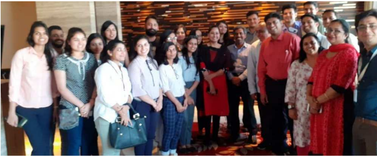
May 27th, 2019 : Coffee with IIHMR @ Jaipur