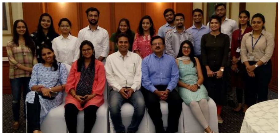
May 23rd, 2019 : Coffee with IIHMR @ Ahmedabad